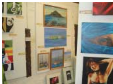
EXHIBIT IN A RESTAURANT